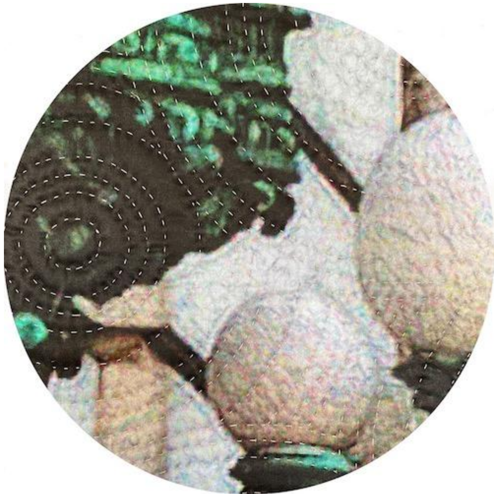
Chambers Street 1 Detail