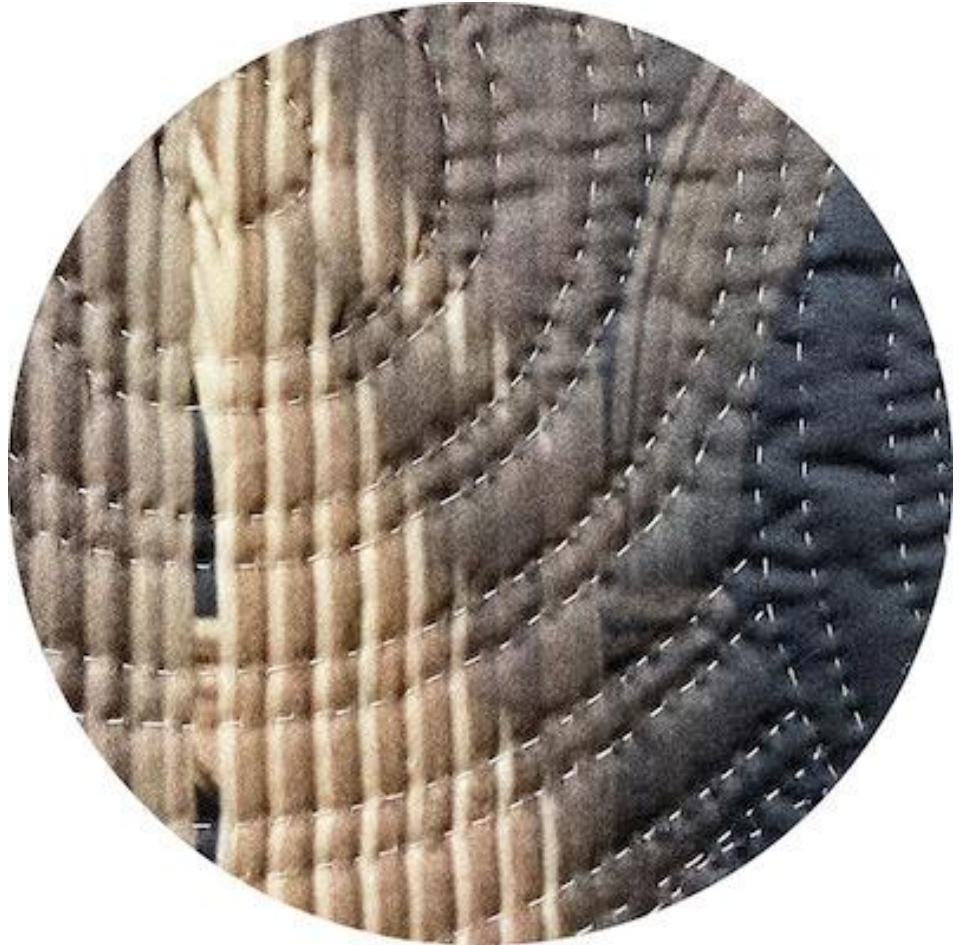
Chambers Street 2 Detail