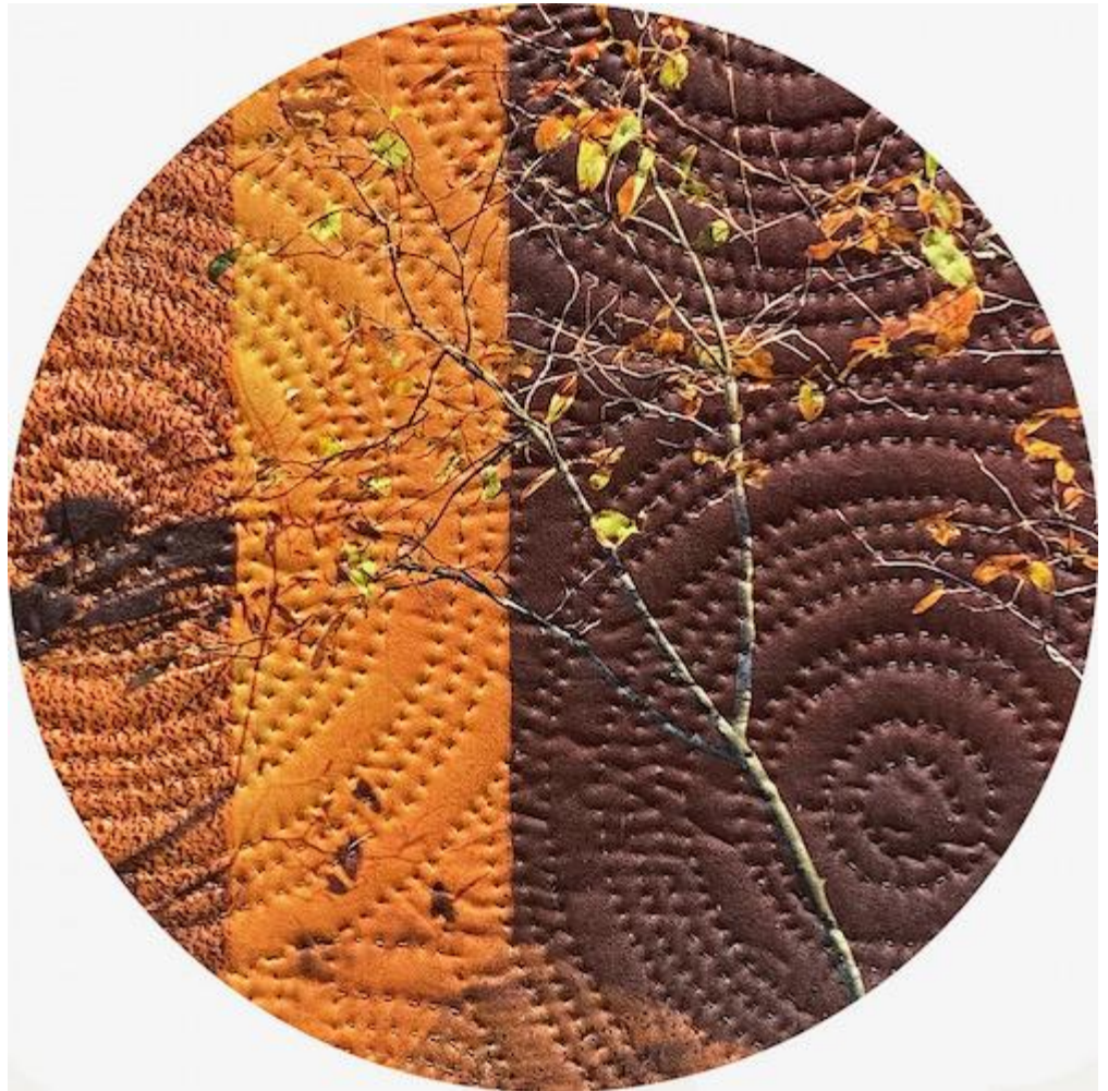
Laguardia Place - Last Leaves Detail